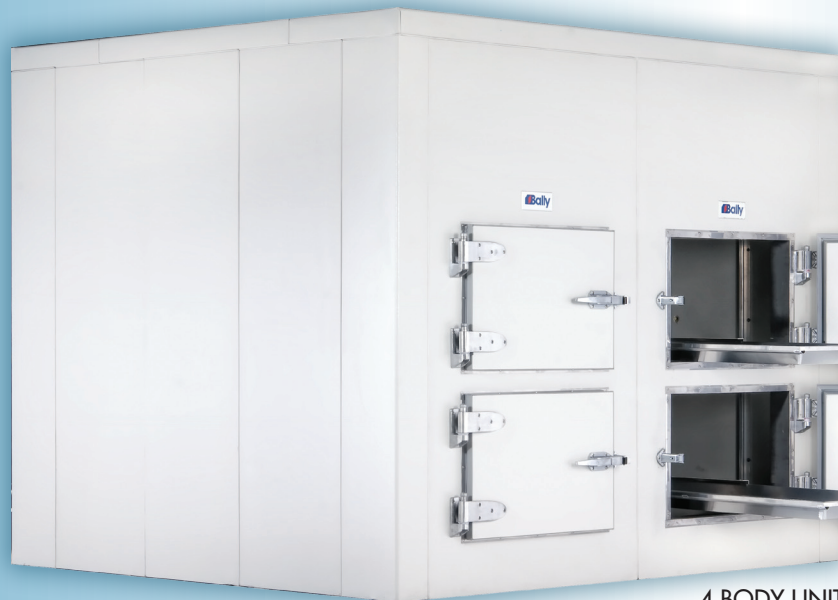
4 BODY UNIT