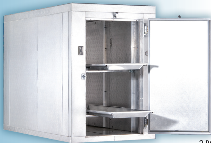
2 BODY UNIT

Bally Mortuary Systems are Distributed Internationally by BMIL.